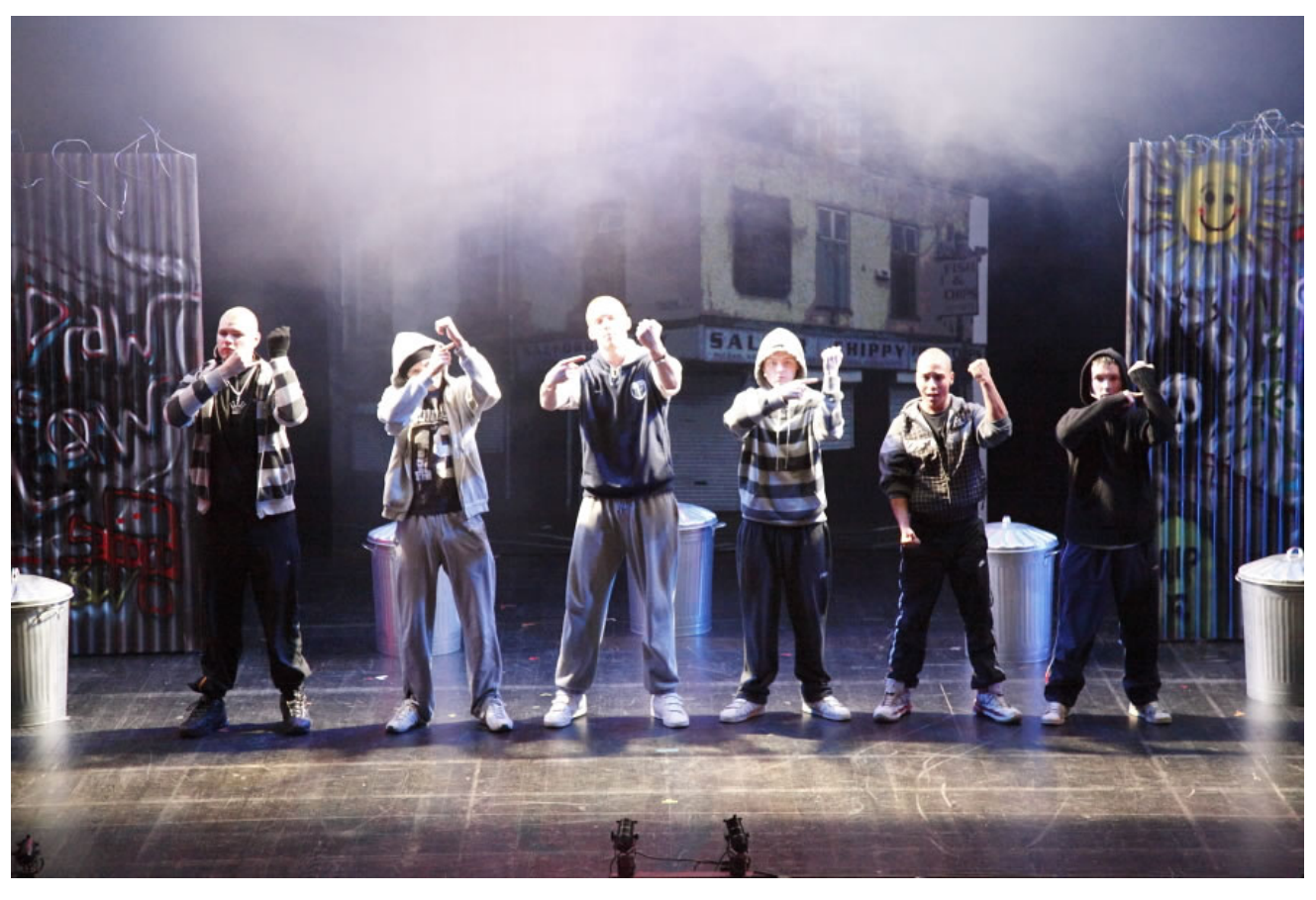
Innit The Musical: Original Cast (2009)