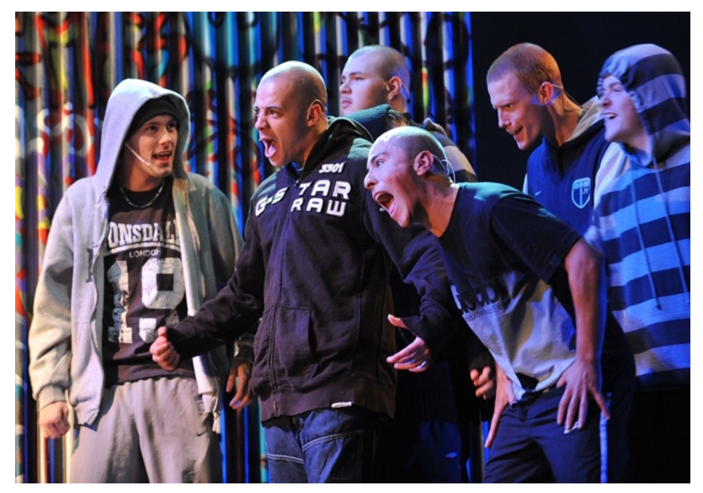
Innit The Musical: Original Cast (2009)

"Our goal is to create a nationally recognised educational theatre production, designed specifically to reach our target audience of working-class young people aged 11 – 25; an audience theatres often struggle to engage"