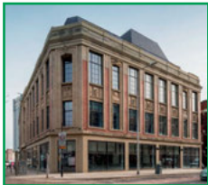
BLACKBURN CENTRAL LIBRARY Town Hall St, Blackburn, BB2 1AG Tel: (01254) 507720 or 581175